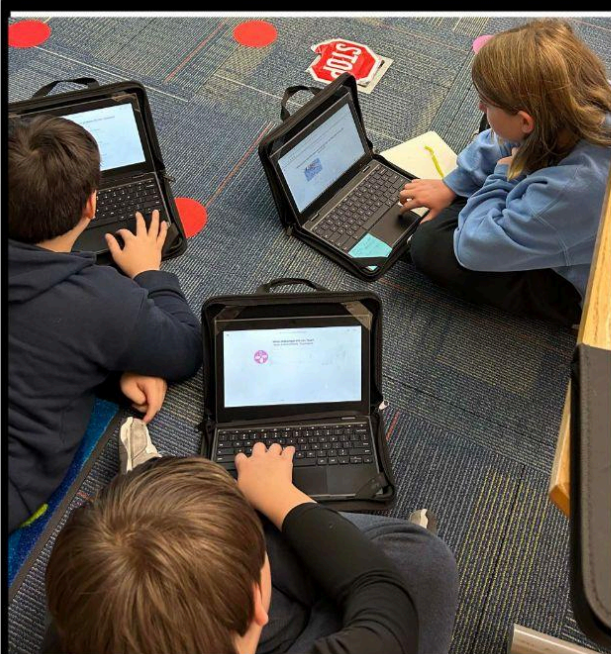
5th graders doing Xello missions