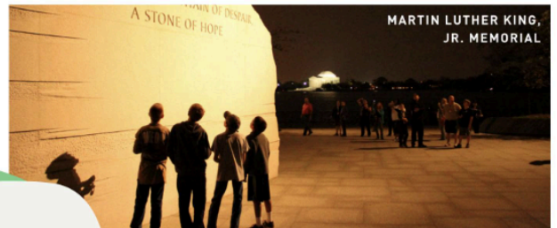
MARTIN LUTHER KING, JR. MEMORIAL