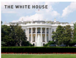
THE WHITE HOUSE