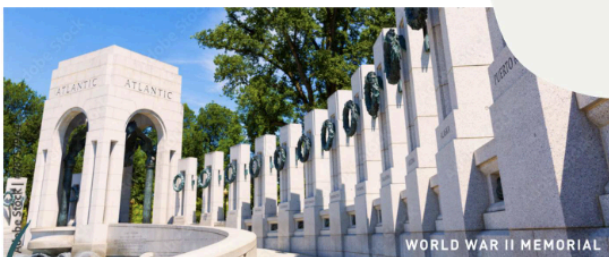
WORLD WAR II MEMORIAL